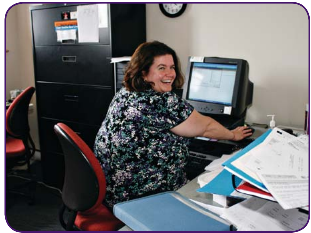
Figure 7: The financial officer at PIH's Prevention and Access to Treatment (PACT) program in Dorchester, MA tracks expenses

Once the transaction has been recorded in an electronic accounting system (if you have one), it is also a good idea to store the paper records that will serve as back-up. Most transactions will be paid by check or cash, or in some cases by credit card. (Checks and cash are still more common in developing countries, although credit card use is increasing.) In the case of checks, there are two records for every transaction: a copy of the bill itself and a copy of the check used to pay that bill. With credit cards, there should be a bill in addition to the credit card receipt. Invoices and other supporting documents relating to each payment are generally stamped "PAID" once the check has been issued. For a payment or donation, save a copy of the donation check and the receipt or copy of the ticket used to deposit the payment or donation into the bank.