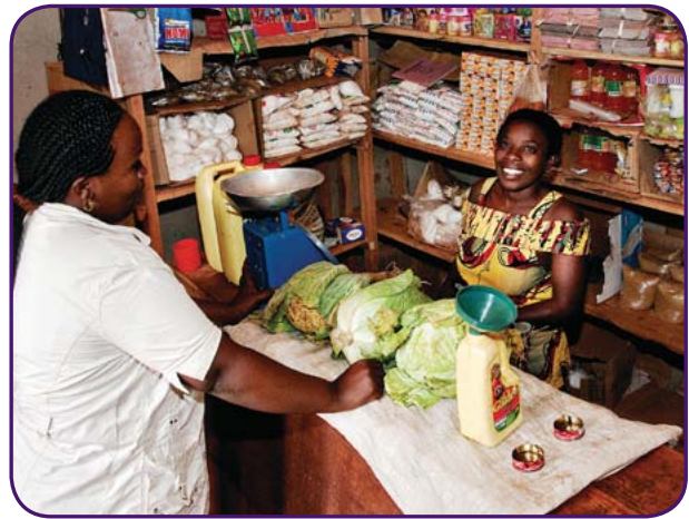
Figure 2: PIH staff in Rwanda make daily cash transactions

independent of the petty cash account transactions, and often by two people to add a level of security and protection in the event a loss is discovered. Depending on the level of activity in your petty cash account, the counts can be done on a daily, weekly, or twice-monthly basis. All cash should be stored in a locked cashbox or safe. Two separate people should have access to the keys or combination, so that responsibility for their safekeeping is shared. Any time possession of keys changes, document that change in writing to avoid confusion.