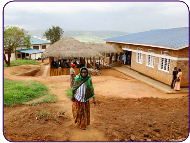
Figure 3: PIH renovated the Rwinkwavu District Hospital owned by the Government of Rwanda

policy, PIH generally does not take title to land or buildings. Instead, we donate any purchased land—along with the buildings constructed on it—directly to the Ministry of Health (MOH) or another government entity. These donations are made through straightforward documents (often drawn up by a lawyer) stating that the land and all constructed assets on it are property of the Ministry. As a result, the purchase of land and construction of buildings is expensed in that year only, rather than capitalized and amortized.