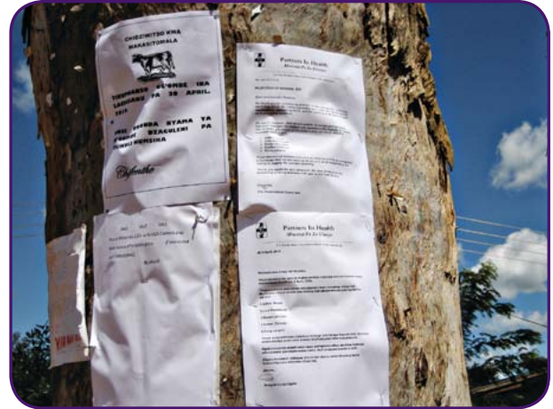
Figure 5: PIH posts requests for tenders on a tree in Malawi

The purchase can be recorded in the financial system as an expense in the appropriate budget and with the correct account codes. This process will be described in greater detail in the next section.