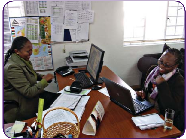
Figure 4: PIH's finance team in Lesotho

At a larger organization, the budget process will probably be decentralized. Local staff members can express their needs to managers who then review requests and build an appropriate budget. Exactly how this process is conducted will depend on the size and experience of your staff. One attribute that holds true regardless of size is that involving key staff will help produce an accurate, responsible plan for the coming year.