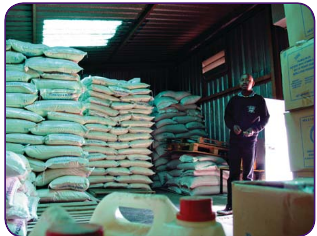
Figure 6: PIH's food program coordinator in Lesotho monitors supplies in the warehouse

Once inventory is recorded in the system as being received, you will also want to track its use—or its departure from the warehouse/storage facility. Tracking the movement of goods into and out of your facilities helps your organization maintain accountability for money spent. Losses due to theft or mismanagement can compromise your operations and, ultimately, your mission. Developing a system that holds employees accountable for missing inventory will minimize theft and encourage regular, accurate data entry. Perform periodic inventory counts once per quarter or once per year and check them against records to detect either counting errors or loss of inventory. The more frequent the checks, the better the chance of detecting errors or loss.