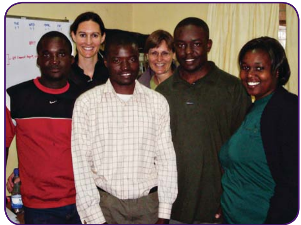
Figure 1: Malawi and Boston finance staff in Malawi

Hiring local staff will also be an important part of initiating your work in-country. Working with people who are committed to your mission but who require additional mentorship in order to build necessary skills can be an effective long-term strategy for building a finance team. Although this approach could sacrifice some short-term efficiency, it is a worthwhile investment in capacity building for staff who are committed to remaining with your organization for some time (see Unit 5: Strengthening human resources for more on recruitment and hiring).